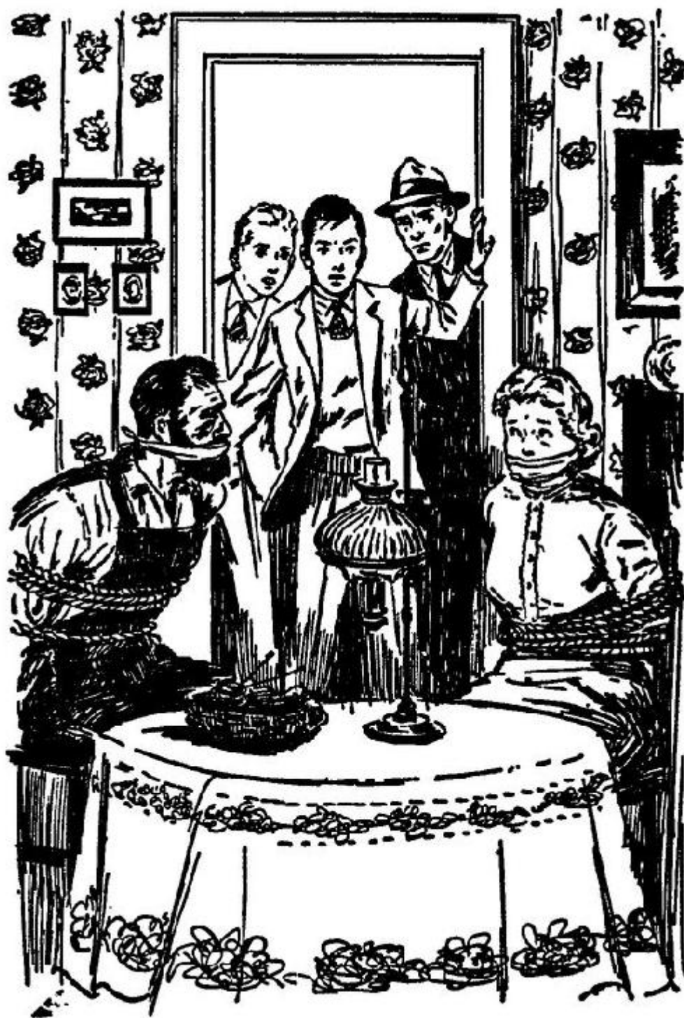
The farmer and his wife were bound and gagged