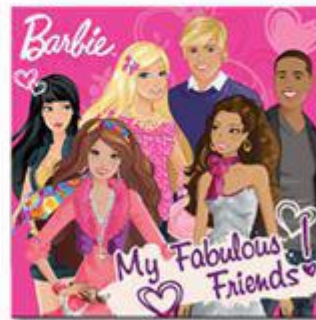
My Fabulous Friends ISBN: 978-0-375-98507-2