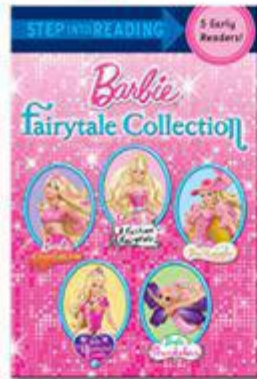
Barbie: Fairytale Collection ISBN: 978-0-375-87255-6