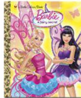
Barbie: A Fairy Secret ISBN: 978-0-375-98485-3