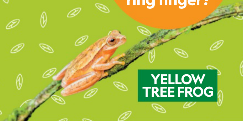
YELLOW TREE FROG