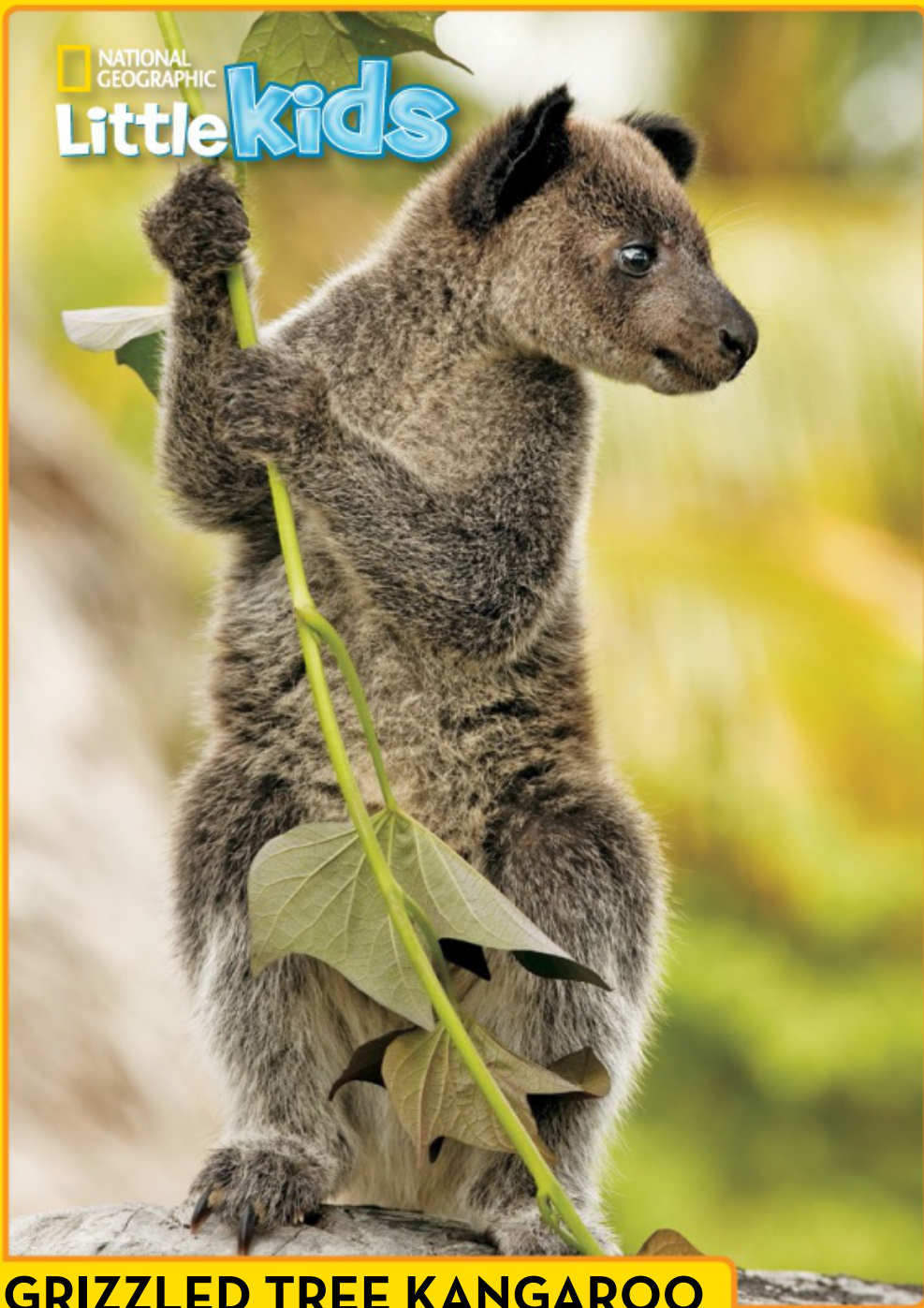
GRIZZLED TREE KANGAROO