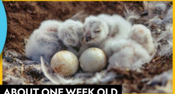
ABOUT ONE WEEK OLD

Female snowy owls lay 3 to 11 eggs at a time. The babies are called owlets.