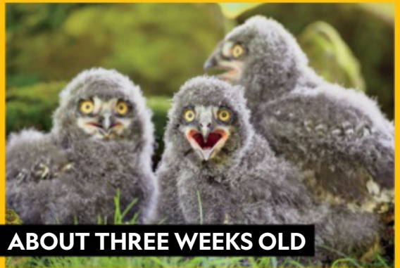
ABOUT THREE WEEKS OLD