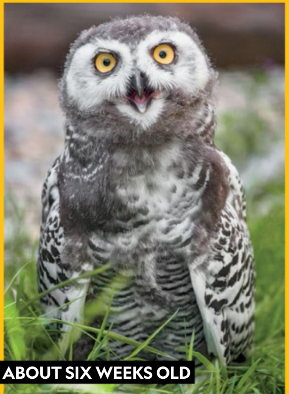
ABOUT SIX WEEKS OLD

As the babies grow, new brown feathers replace the down. Soon the young owls will fly away and hunt for their own food.