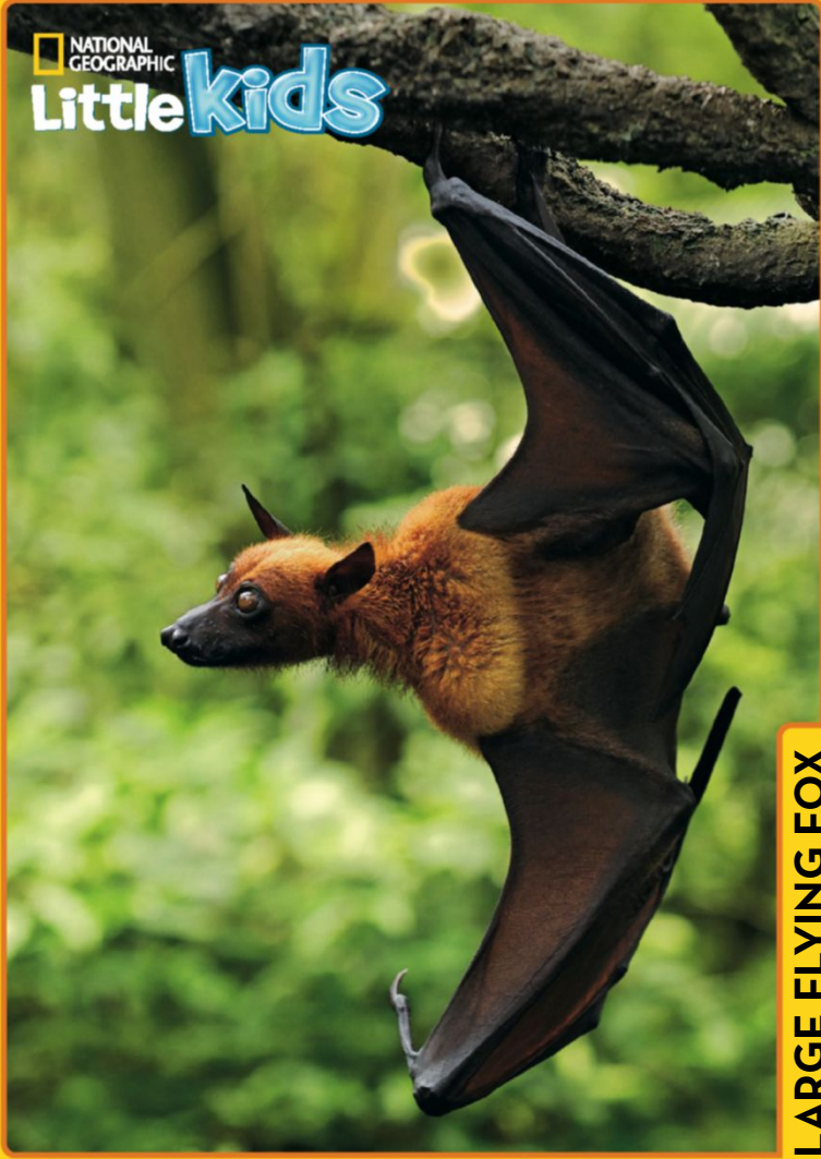
LARGE FLYING FOX