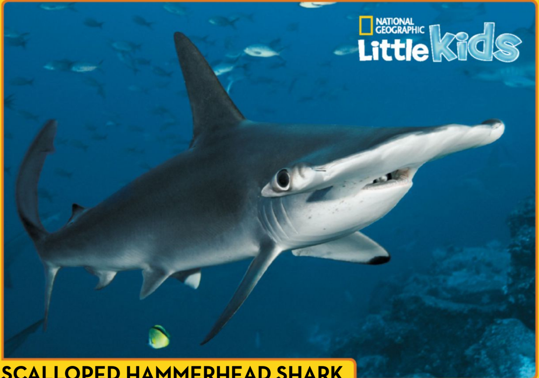
SCALLOPED HAMMERHEAD SHARK