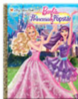
Princess and the Popstar (Barbie) ISBN: 978-0-307-97677-2