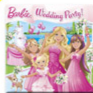
Wedding Party! (Barbie) ISBN: 978-0-307-97481-5