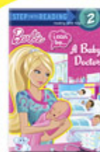
I Can Be... A Baby Doctor (Barbie) ISBN: 978-0-307-98113-4