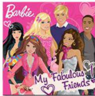
My Fabulous Friends ISBN: 978-0-375-98507-2