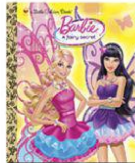
Barbie: A Fairy Secret ISBN: 978-0-375-98485-3