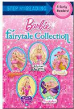
Barbie: Fairytale Collection ISBN: 978-0-375-87255-6