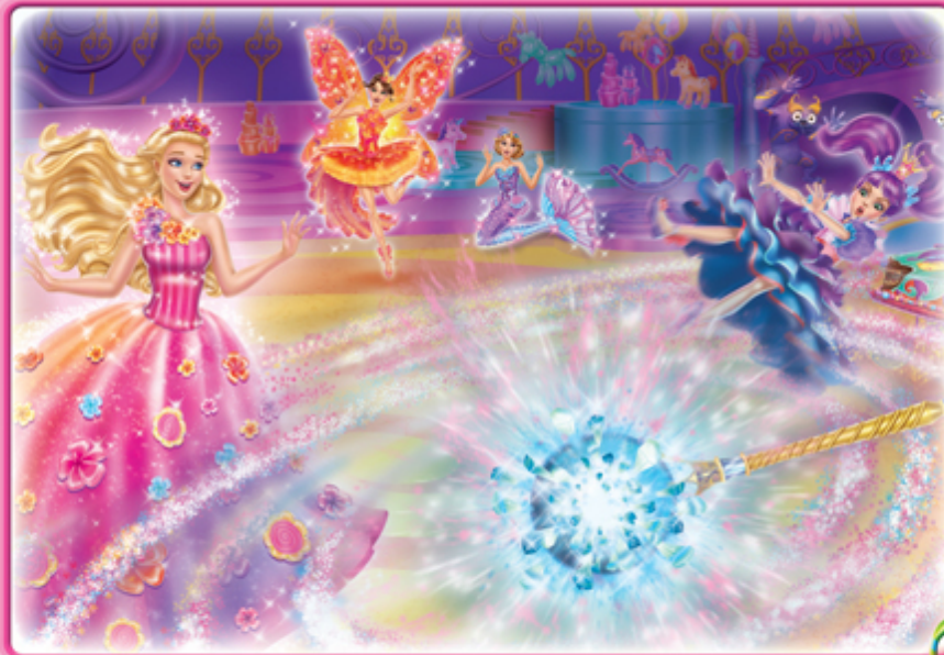
Alexa's magic breaks Malucia's scepter and defeats the spoiled princess.