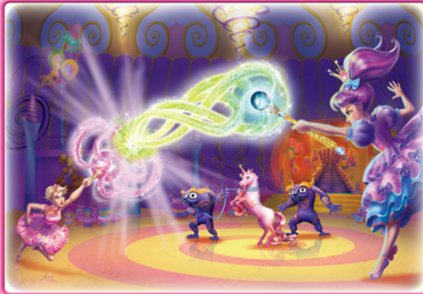
Alexa battles Malucia with magic.