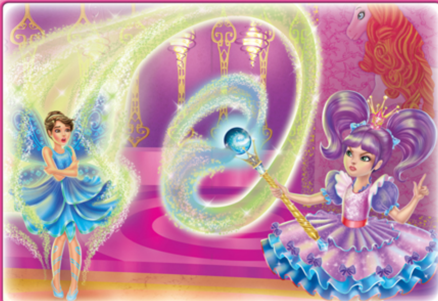
Princess Malucia is stealing all the magic in the kingdom.