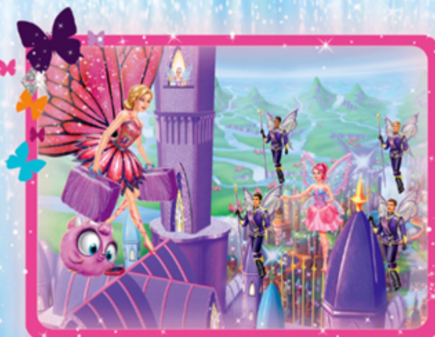
Mariposa and her puffball friend Zee arrive in Shimmervale.