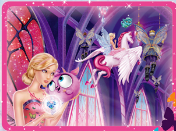
Mariposa is sad when her meeting with the king does not go as well as she hoped.