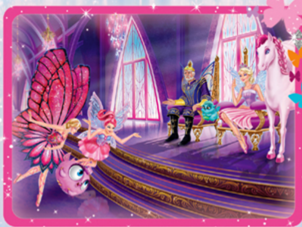
Mariposa meets King Regellius and Princess Catania.